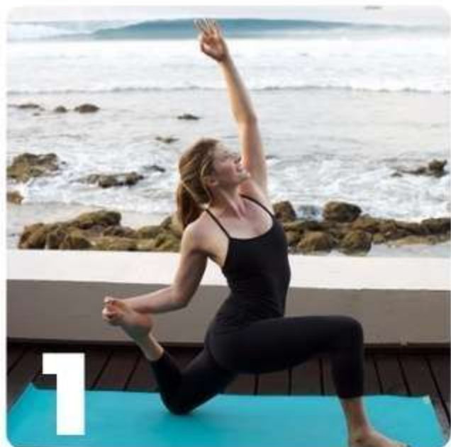
YOGA & HEALTH CENTRE