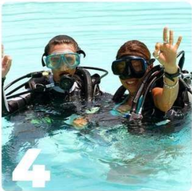
VARIETY OF WATER SPORTS