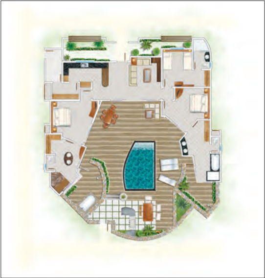
3-Bedroom Pool Villa