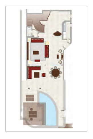
Royal Suite - Ground Floor