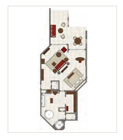
Palm Suite (layout differs for families)