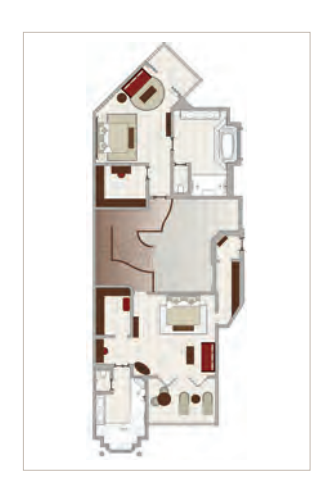
Royal Suite - First Floor