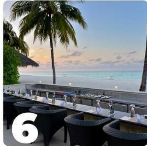
Koko Grill Show-stopping, ten-course Japanese dining!