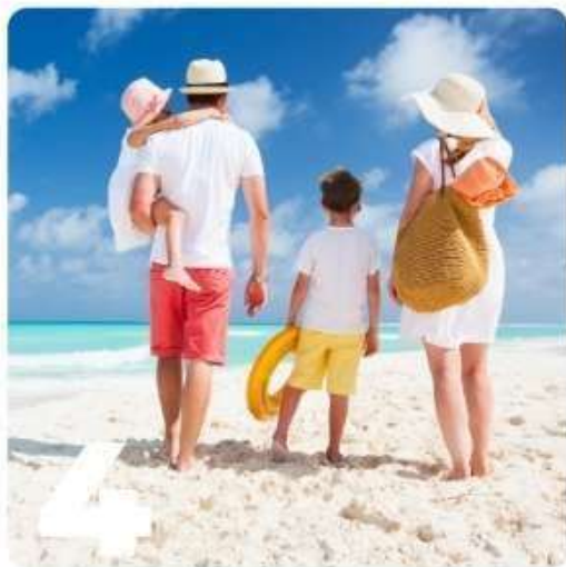
PERFECT FOR FAMILIES & COUPLES!