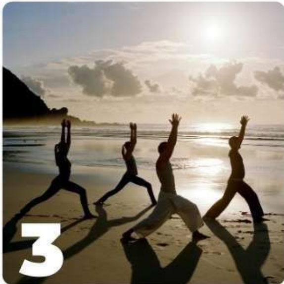
YOGA & ZUMBA SESSIONS