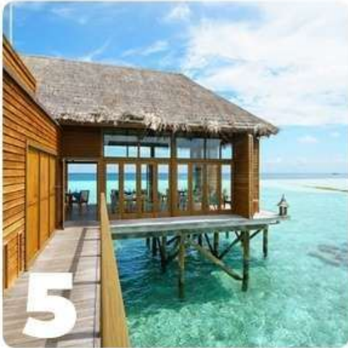
Mandhoo Spa restaurant Specially crafted menus!