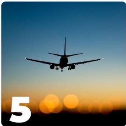
A SHORT DOMESTIC FLIGHT TO NEARBY ISLAND