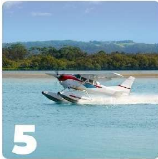
SEAPLANE RIDE TO THE RESORT (30 MINS)