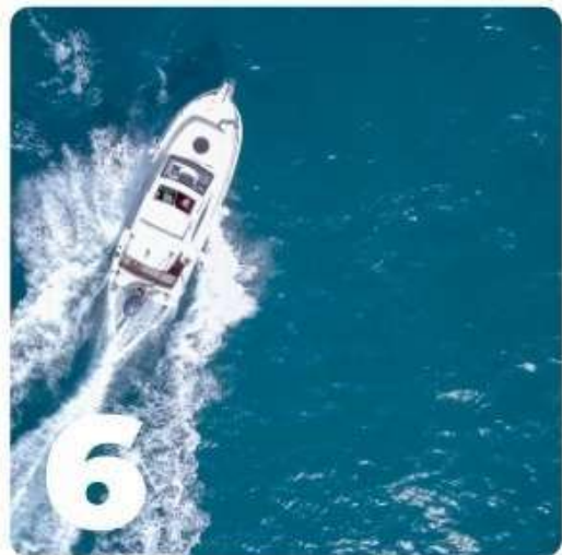
FOLLOWED BY A SPEEDBOAT RIDE TO THE RESORT