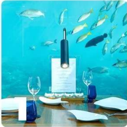
UNDERWATER VILLA & RESTAURANT!