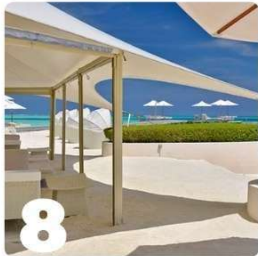
The Quiet Zone Enjoy all-day dining & bespoke cocktails