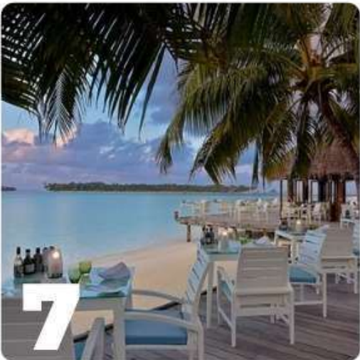
Vilu Restaurant & bar Featuring Mediterranean- inspired cuisine.