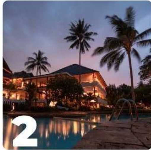
LUXURY RESORT FOR CELEBRITY LIKE FEELS!