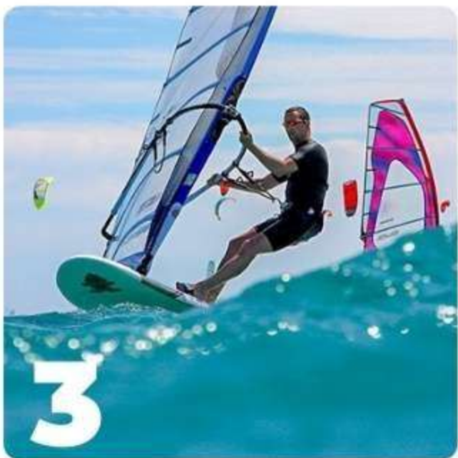
WATER SPORTS ADVENTURE