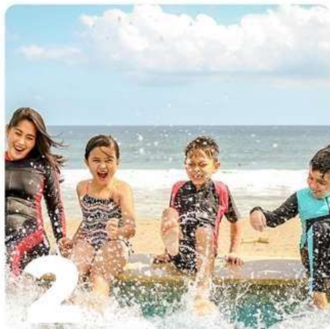
KOKA KID'S CUB