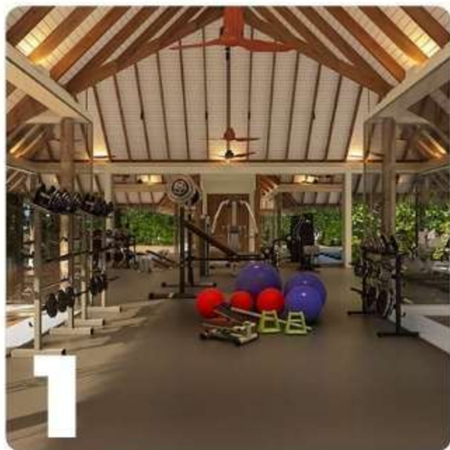
FULLY EQUIPPED GYMNASIUM