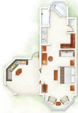
Junior Suite / Junior Suite Beachfront / Zen Suite / Zen Suite Beachfront