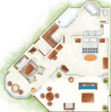
Senior Suite / Senior Zen Suite