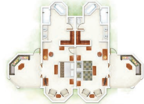
2-Bedroom Family Suite