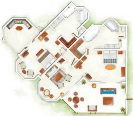
2-Bedroom Luxury Family Suite