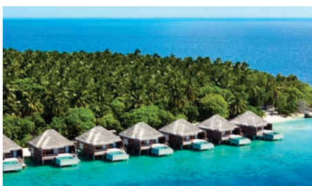
Lagoon Villas with Pool