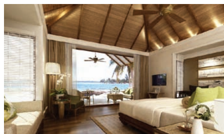
Beach Villa Bedroom