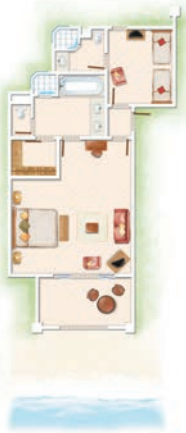
2-Bedroom Family Apartment