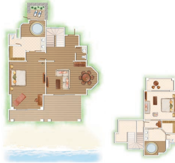
2-Bedroom Family Suite