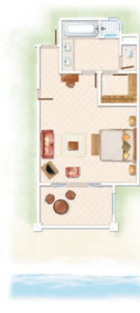
Deluxe Room / Deluxe Ground Floor