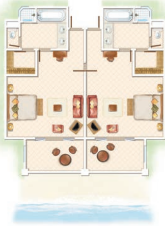
2-Bedroom Deluxe Family Apartment