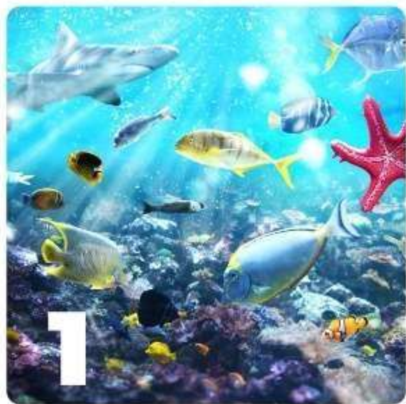
COLORFUL MARINE LIFE