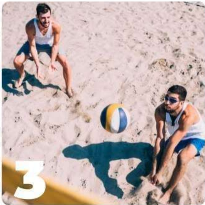
BEACH SOCCER & VOLLEYBALL