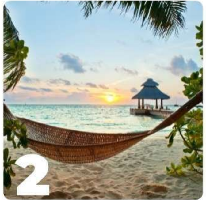
WHITE SAND BEACH