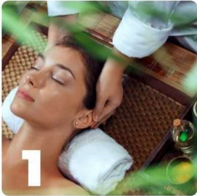
IN-RESORT AFFORDABLE SPA