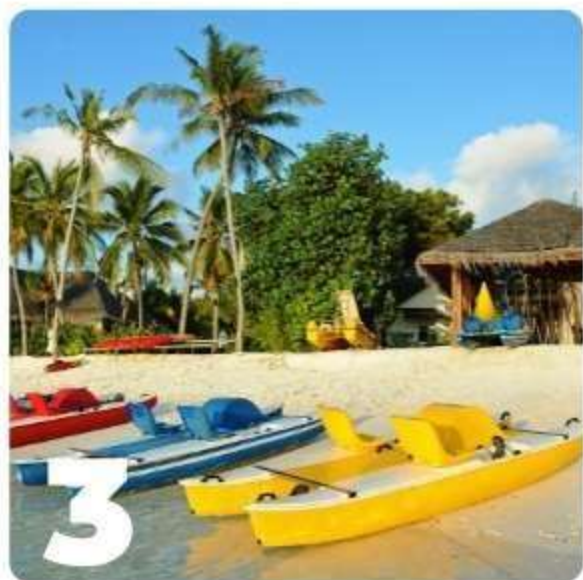
MANY WATER SPORTS ACTIVITIES!