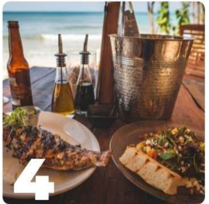
PRIVATE BEACH DINING