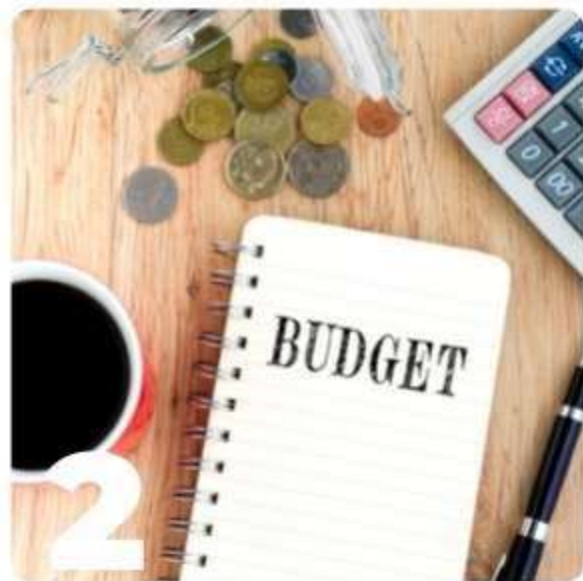
BUDGET FRIENDLY PROPERTY